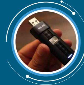
Pen Drive Connectivity