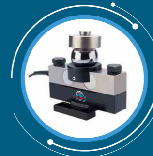
Digital Load Cell