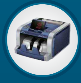
Currency Count Machine